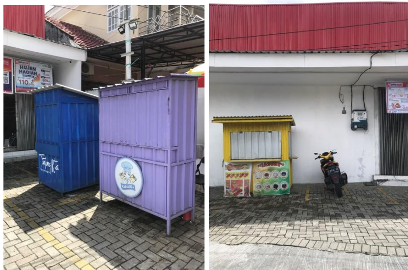
Figure 5. Business Actors in Front of Modern Stores

The observations show that since the emergence of Indomaret and Alfamidi in the city of Ambon, many new business actors have also emerged in the city of Ambon. The emergence of these business actors is due to the availability of places for new MSME actors provided by Indomaret and Alfamidi. The observations on Indomaret and Alfamidi in Batu Merah village show that there are MSME actors around the Indomaret and Alfamidi parking areas. Here we show pictures of some MSME actors in front of the Indomaret and Alfamidi parking areas located in the Batu Merah village area.