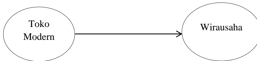
Figure 6. Relationship between Modern Stores and Entrepreneurs