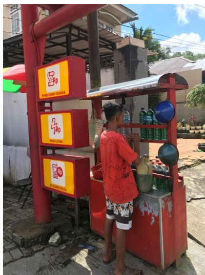
Figure 2. Red Stone Gas Station Condition