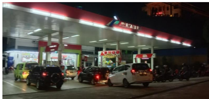
Figure 1. Red Stone Gas Station Condition

The results showed that by observing, many new business actors emerged in Batu Merah village, Ambon city. Business actors who have sprung up in Ambon are not only sellers of drinks or food, even those who sell motor vehicle fuel (retail gasoline) in bottles. The rise of retail gasoline sellers has sprung up because petrol stations (gas stations) have limited operating hours due to the COVID-19 pandemic. The results of interviews with motorists found that they did not want to queue because there were many buyers at gas stations, so they bought more often from retail gasoline sellers. Documentation results show that gasoline buyers at gas stations in Batu Merah village are very dense. The following is a picture of buyers of fuel oil at the Batu Merah gas station.