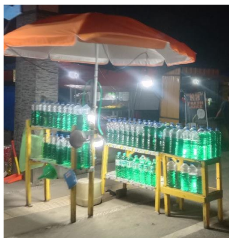
Figure 4. Entrepreneurs who started during the pandemic

The COVID-19 pandemic has hugely impacted business actors in Batu Merah Village, Ambon City. Not only a negative influence but also a positive influence on business actors in the city of Ambon. The observation results show that many new business actors run businesses during the COVID-19 pandemic, especially in SMP 14 N Ambon road to BTN Kanawa, an Ambon city. Even though the pandemic affected business actors at a macro level, this did not scare the people of Ambon city to start entrepreneurial activities. The following is a picture of some of the businesses started during the COVID-19 pandemic in Batu Merah village, Ambon City.